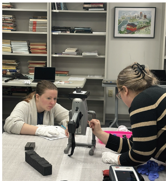
Chem4000 students using XRF on a Chinese thumb ring.