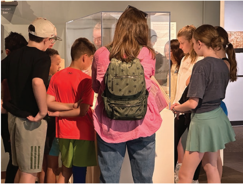
Image: 6th graders visiting the exhibit on human origins loved the replica hominin skulls. May 2024