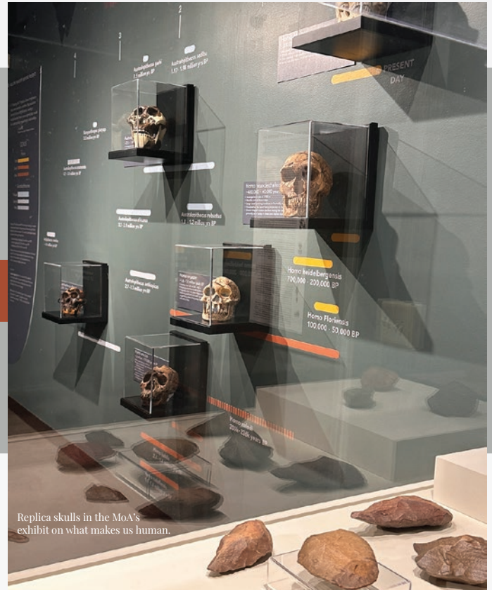
Replica skulls in the MoA's exhibit on what makes us human.