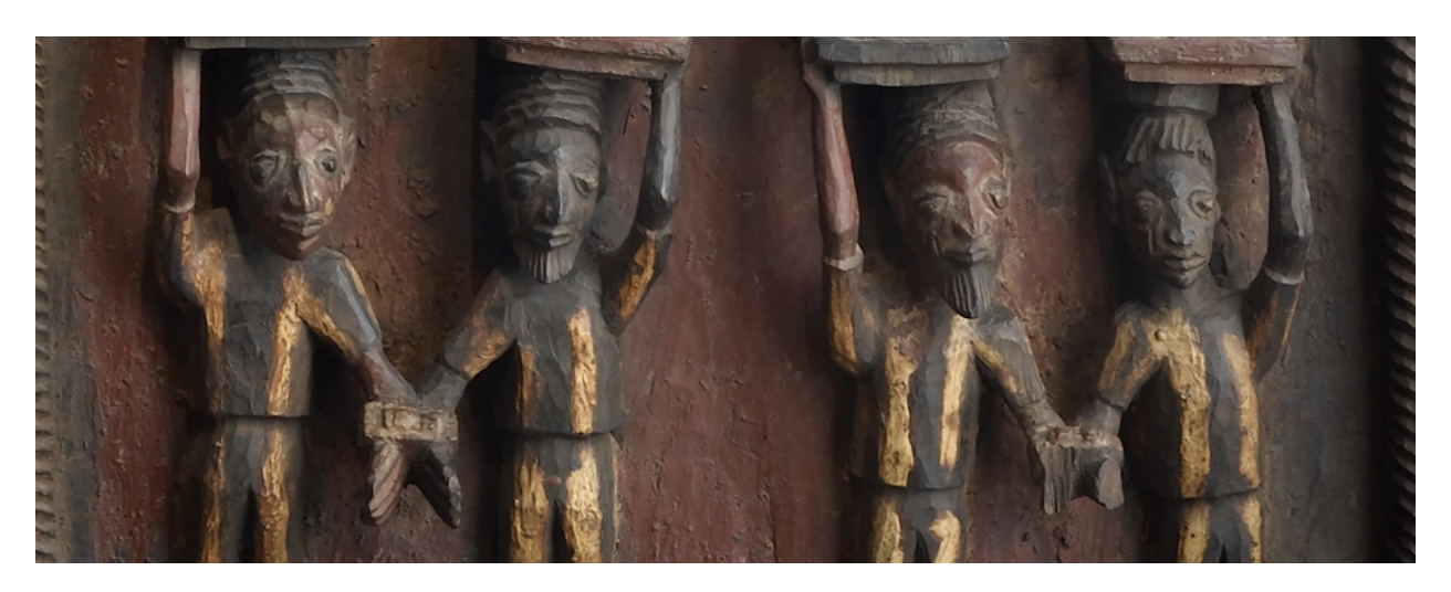
Next, utilize Teaching History with 100 Objects, Palace Doors from Nigeria. http://teachinghistory100.org/objects/palace doors

Show students close-up images and details of the door panels. Explain briefly the occasion that the panels depict. Help them to identify and comment on the different characters: the Ogoga, his queen, Captain Ambrose, the porters and what they are carrying, the prisoners, soldiers, animals etc.