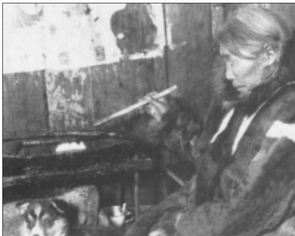
Inuit woman tending an oil lamp inside a house, 1921.