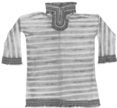
Aleut gutskin shirt, ca. early 19th century

The Aleut gutskin shirt pictured is another example of this type of garment. It is made of strips of walrus intestine and decorated with yarn, feathers, and eagle down. This particular style, with the high collar and yarn decoration, probably shows the influence of Russian clothing on the production of native garments.