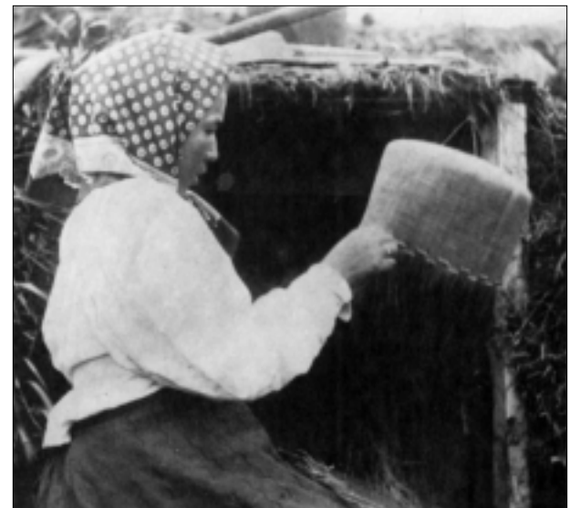
Aleut woman making a basket, ca. 1900.