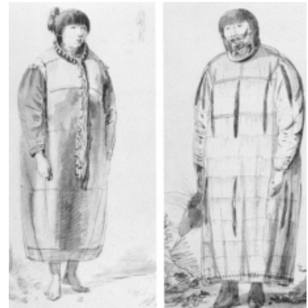
Aleut man and woman from Unalaska, ca. 1760.

University of Missouri-Columbia Museum of Anthropology