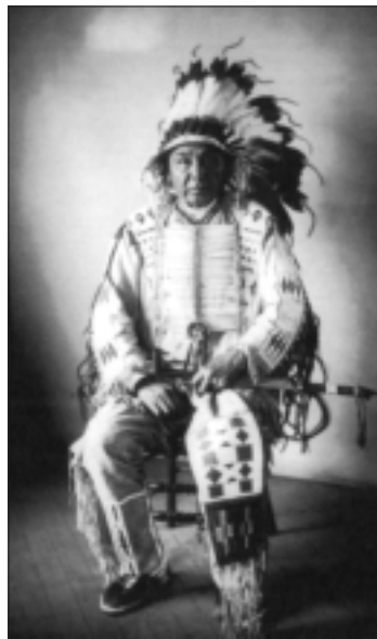
Yanktonai Sioux man holding pipe and tobacco pouch, ca. 1900.

tending to involve small raids rather than large battles between tribes. Sioux men were particularly well-known as skilled warriors. Stone-headed war clubs were often used in battle even after firearms were acquired because prestige was gained through actually striking the enemy. In later times, these types of clubs were made and carried by men as signs of status rather than for use as weapons.