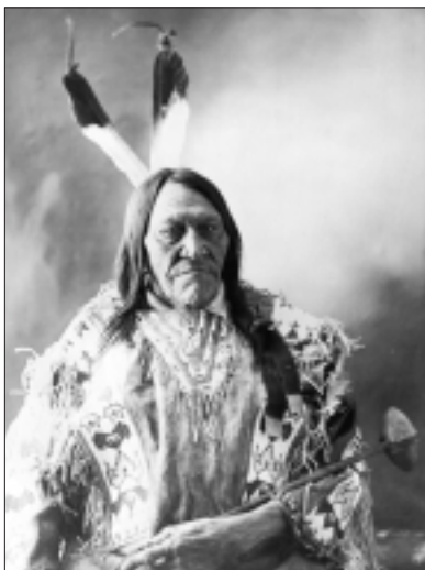
Chief Two Strike, Brulé Sioux, holding stone-headed war club, ca. 1900.