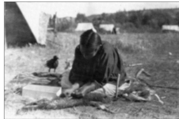
Sioux woman pulling quills from a porcupine, 1908.