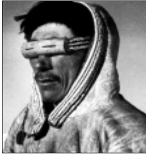
Canadian Inuit wearing snow goggles, ca. 1950.

Vision is provided through a narrow horizontal slit. Snow goggles have been found in prehistoric sites in Alaska, evidence that Native Alaskans had “sunglasses” long before European contact.