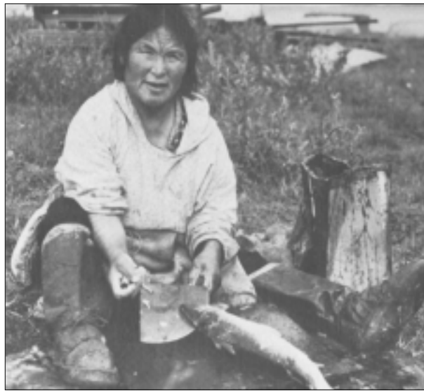
Inuit woman using an ulu to cut fish, ca. 1940.