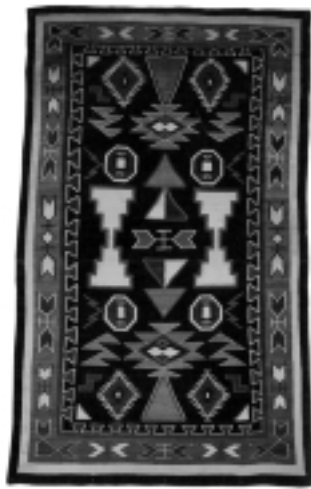
Navajo Teec Nos Pos style rug showing Oriental rug influences, ca. 1910.

According to Navajo traditions, weaving is an art form learned from the spiritual figure Spider Woman. However, archaeological and ethnographic research indicates the Navajo acquired weaving skills from the Pueblo Indians in the late 1600s, using wool