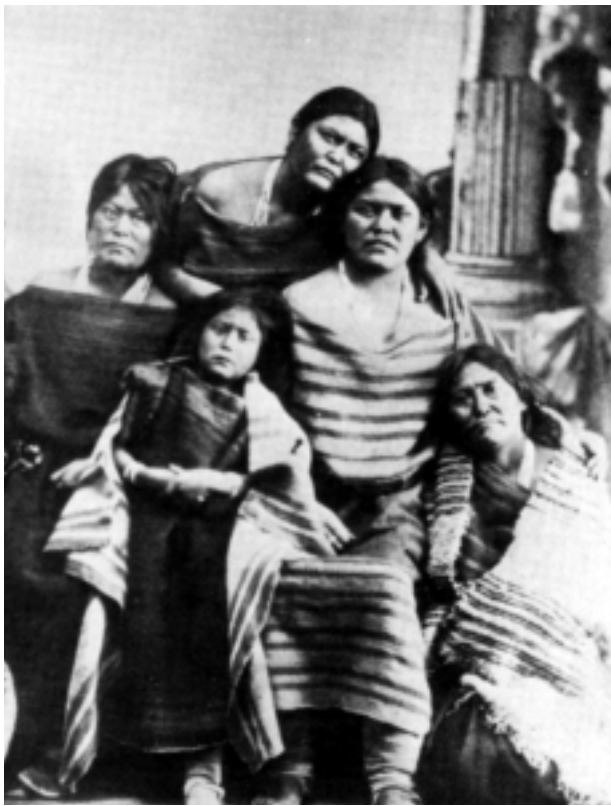
Navajo women in blanket dresses, ca. 1865.