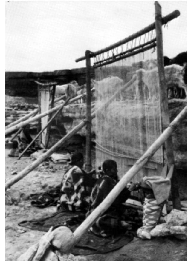
Navajo weavers at loom, ca. late 19th c.

University of Missouri-Columbia Museum of Anthropology