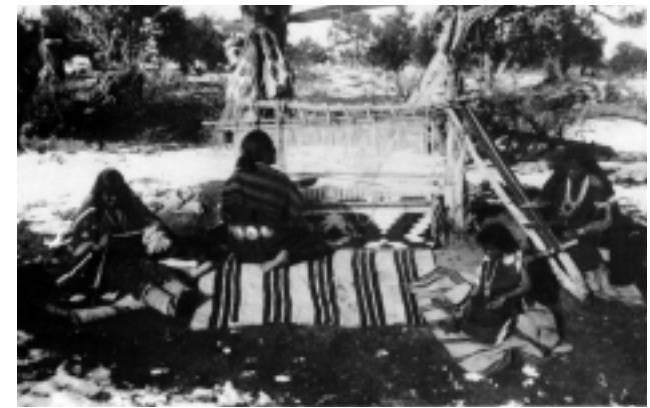
Navajo women carding, spinning, and weaving, ca. 1893.

and were influenced by Pueblo and Mexican weavings. Navajo textiles during this time period were made from wool from the weaver's own sheep that was carded, spun, and dyed by the weaver. After continued contact with white traders and settlers in the 19th century, Navajo weavers had access to new yarns, dye colors, and weaving techniques. They also began selling their woven goods to whites, which meant producing patterns pleasing to Anglo tastes. Traders and dealers influenced Navajo designs by encouraging the use of heavily patterned and brightly colored designs, pictorial figures, and Oriental rug motifs. Looms were adapted to produce hallway rugs and wall hangings rather than the traditional blankets. Today, Navajo rugs are considered works of art that are valued