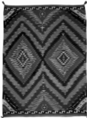
Navajo "eye-dazzler" blanket, late 19th c.

After continued contact with white traders and settlers in the 19th century, Navajo weavers had access to new yarns, dye colors, and weaving techniques. They also began selling their woven goods to whites, which