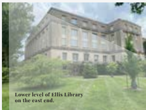
Lower level of Ellis Library on the east end.