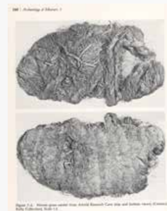
Padded sandal with side loops and cord to criss-cross and tie at the ankle. 8,325-8100 years Before Present. (6,325-6,100 BC)