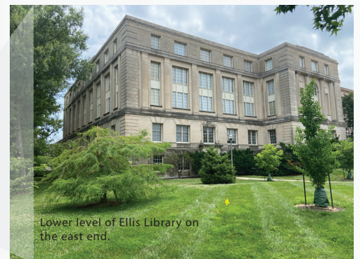
Lower level of Ellis Library on the east end.