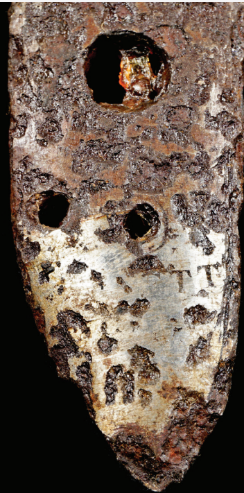
BARNETT lock plate, early 19th century Carrington site (23VE1) - the "E-T-T" is still visible

MUSEUM CLOSING DATE OCTOBER 15, 2021 2PM