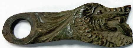
Serpent's head detail

identified. At the time of Missouri's statehood in 1821, the Northwest trade gun was in its height of popularity. These guns became so ubiquitous across the frontier that they all became known as Northwest trade guns, even though they were manufactured by various different companies and countries throughout the fur trade era.