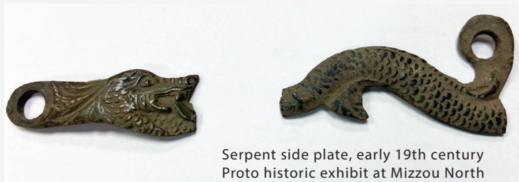
Serpent side plate, early 19th century Proto historic exhibit at Mizzou North

Thinking of the bicentennial and the time period during which Missouri became a state, one can't help but think of the massive change that was happening. Next to the introduction of the horse, one of the most profound alterations in native cultural life was the widespread access to firearms. As trade for European goods increased, we can see the archaeological record begin to drastically change, especially at Osage sites in Vernon and Saline counties. Gun parts were prominent at these sites and many examples of Northwest trade guns have been