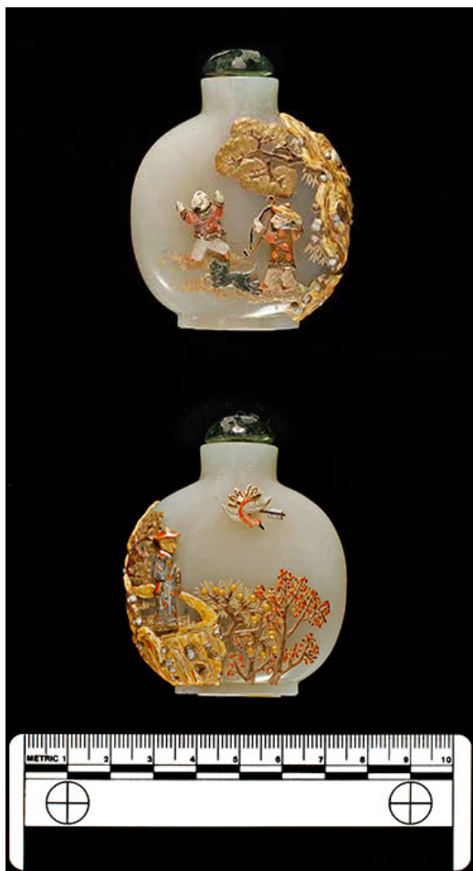
Jade Bottle Qing Dynasty, China Jade and Ivory

In the Lunar Calendar the dog represents loyalty, bravery, diligence, sincerity, and reliability. This archer's thumb ring, also from the Qing Dynasty, is carved with two dogs, instilling the wearer with these virtues. The dog also appears in Chinese sculptures, paintings, and official state seals.