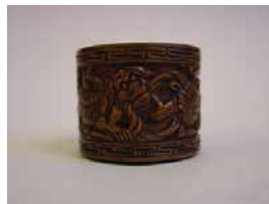
Thumb Ring Qing Dynasty, China Wood